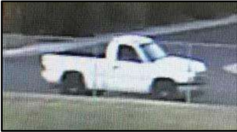
Vehicle of interest